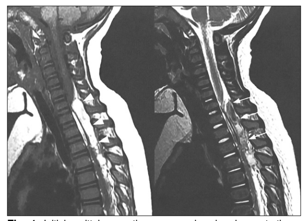
Fig. 1. Initial sagittal magnetic resonance imaging demonstrating a posterior, extradurally lobulated contour from the 7th cervical spine to the 4th thoracic spine, which is seen as a high signal intensity lesion (arrow heads) on the T1 weighted image and low signal intensity lesion (arrows) on the T2 weighted image.

Most reported cases of SSEH in the literature occurred in adult. Only 35 pediatric cases have been previously described reported in the past literature, and among them only 13, including our case, have been reported in infants<sup>6,29)</sup>, and there is no sexual preponderance in toddlers (Table 1)<sup>8,21)</sup>.