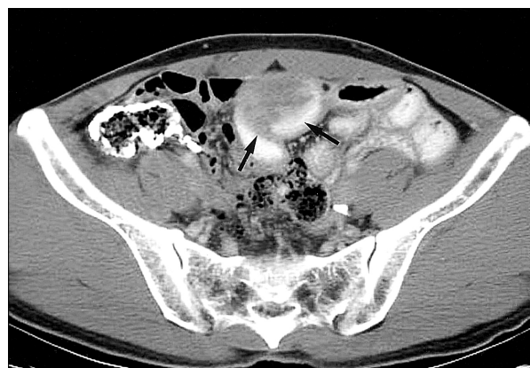
Fig. 1. CT scan shows a mass (arrows) in the lumen of the jejunum with subtle contrast enhancement. Minimal bowel dilation is also seen proximal to the jejunal mass.

A 35-year-old man presented with a 1-month history of dizziness, palpitation and indigestion. He had a feeling of fullness in his epigastrium and he had experienced a weight loss (5 Kg/month). On physical examination, the patient was pale with a blood pressure of 130/70 mmHg. The admission laboratory tests revealed a Hb of 9.1 g/dL, a Hct of 30%, normal platelets and normal coagulation parameters. The stool was positive for blood, but there is no bleeding focus in esophagogastroduodenoscopy, and colonoscopy. A CT scan was performed for further evaluation, and it showed a mass in the lumen of the jejunum with subtle contrast enhancement. Minimal bowel dilation was also seen proximal to the jejunal mass (Fig. 1). Enteroclysis revealed a short segment of jejunal stricture with central ulceration (Fig. 2).